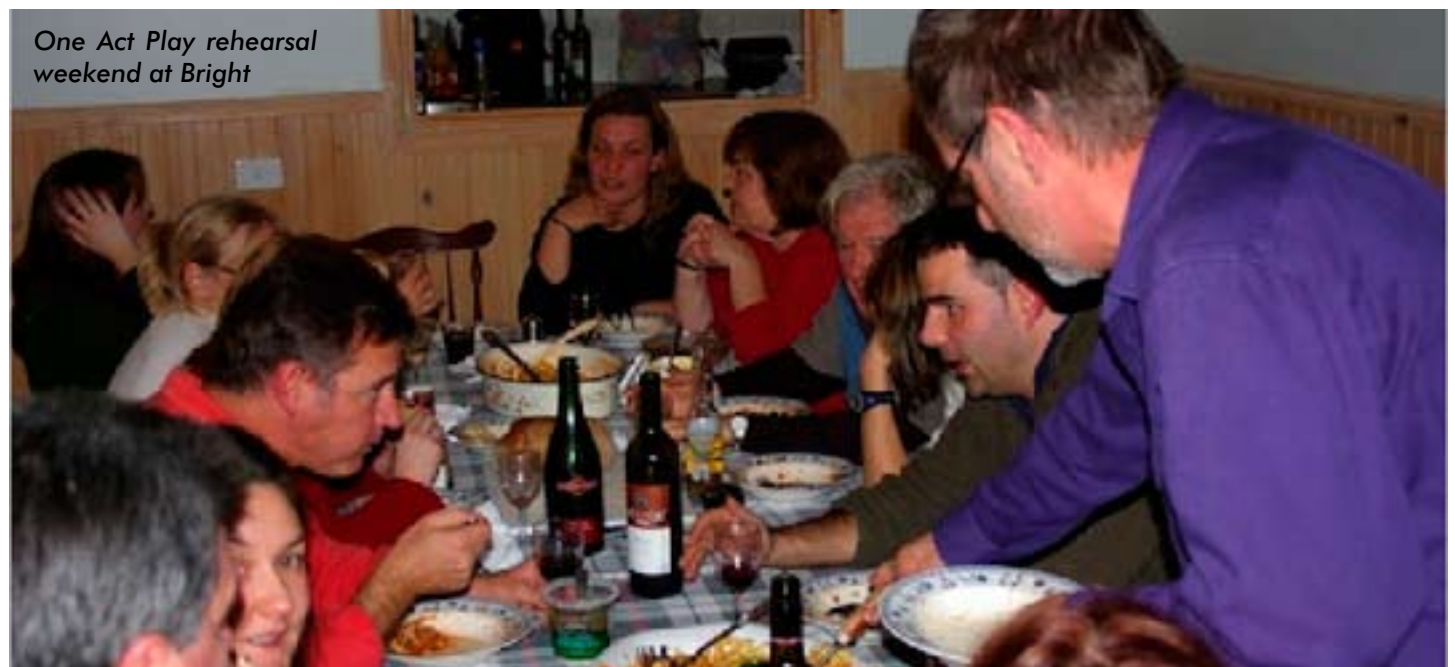
One Act Play rehearsal weekend at Bright

Family $25 Adult $15 Junior $10 Would you like your newsletter sent by email? YES NO